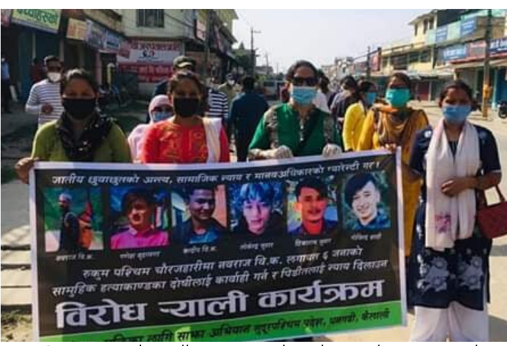
FEDO team at the rally organized to demand justice to the victims