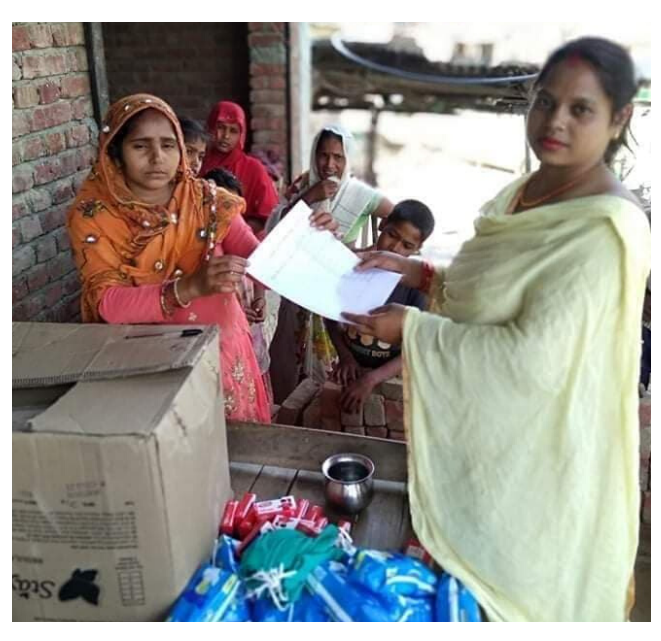
FEDO Banke distributed sanitary pads to women and girls group of different RM of Banke

In between the raging Coronavirus crisis across the world, FEDO has implemented Relief and Response program in different districts of Nepal by distributing food and some hygiene kits: rice,pulses, mustard oil, wheat, flour, potatoes, salt, sugar and soap to Dalits, poor and the most vulnerable ones as to address the urgent need of Dalit women and marginalized groups at local level. Along with this, FEDO also initiated to distribute sanitary pads and other medical kits to girls andwomen of different district for ensuring their improved menstrual hygiene and good health.