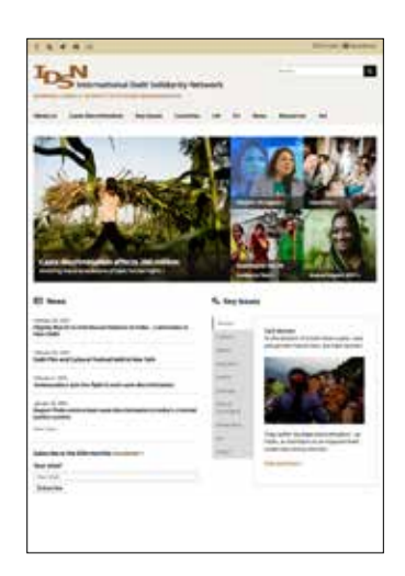
The IDSN website www.idsn.org

was founded in March 2000 to advocate for Dalit human rights and to raise awareness of Dalit issues nationally and internationally. IDSN is a network of international human rights groups, development agencies, national Dalit solidarity networks from Europe, and organisations in caste-affected countries. IDSN engages with the United Nations, the European Union and other multilateral institutions, working for action-oriented approaches to address 'untouchability' and other human rights abuses against Dalits and similar communities that suffer discrimination based on work and descent. IDSN bases its work on contributions from members, associates and affiliates. The network produces crucial input in the form of documentation, strategic interventions and lobby action and also supports national level lobbying.